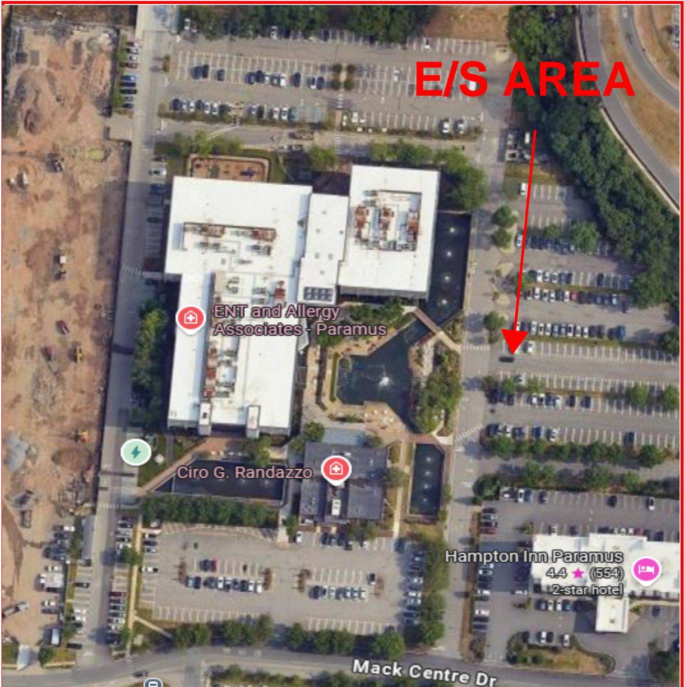
EMERGENCY STAGING AREA IS IN PARKING AREA AS SHOWN IN RED "E/S AREA"