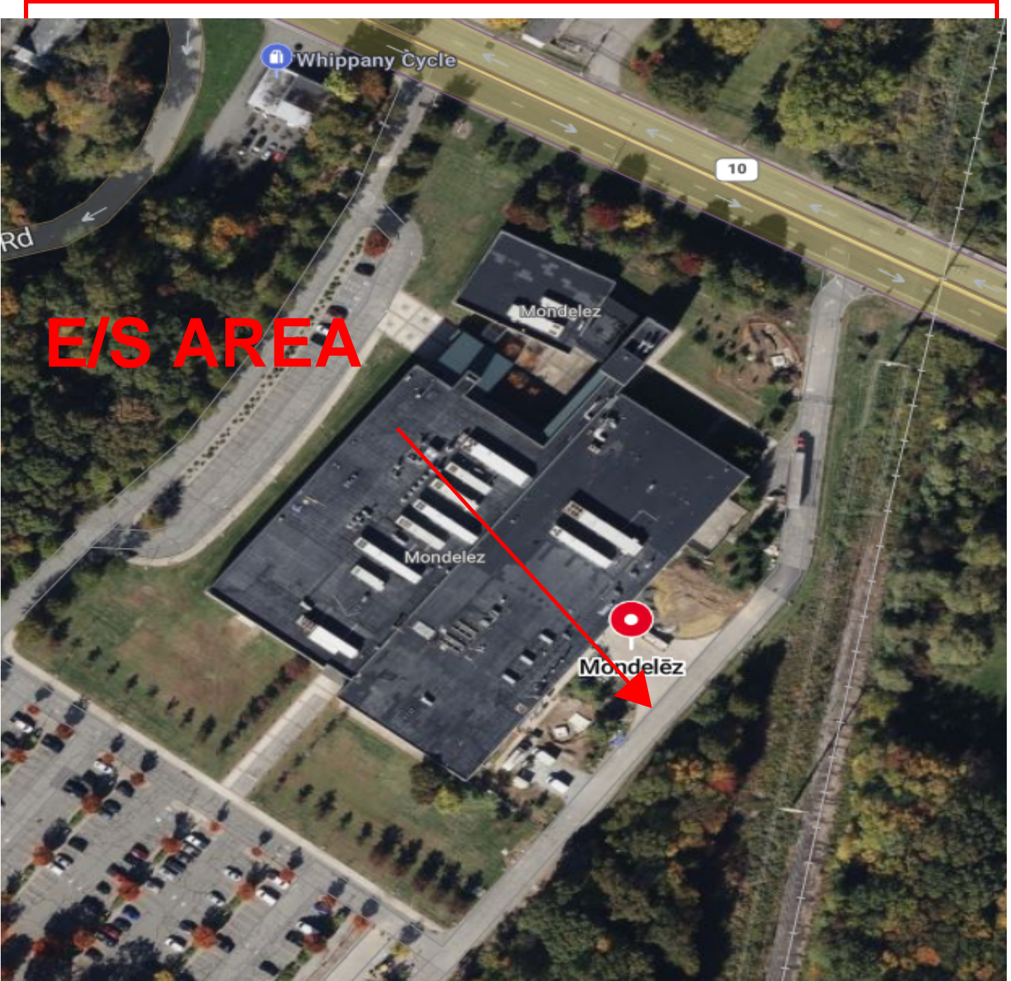
EMERGENCY STAGING AREA IS IN PARKING AREA AS SHOWN IN RED "E/S AREA"