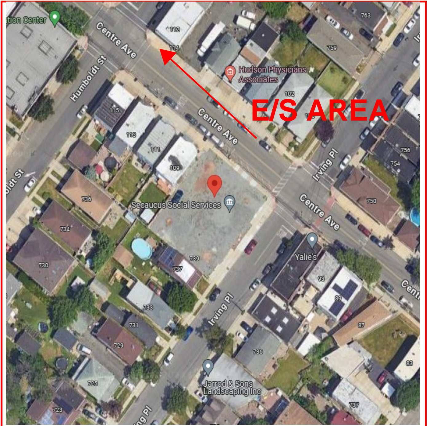
EMERGENCY STAGING AREA IS IN PARKING AREA AS SHOWN IN RED "E/S AREA"