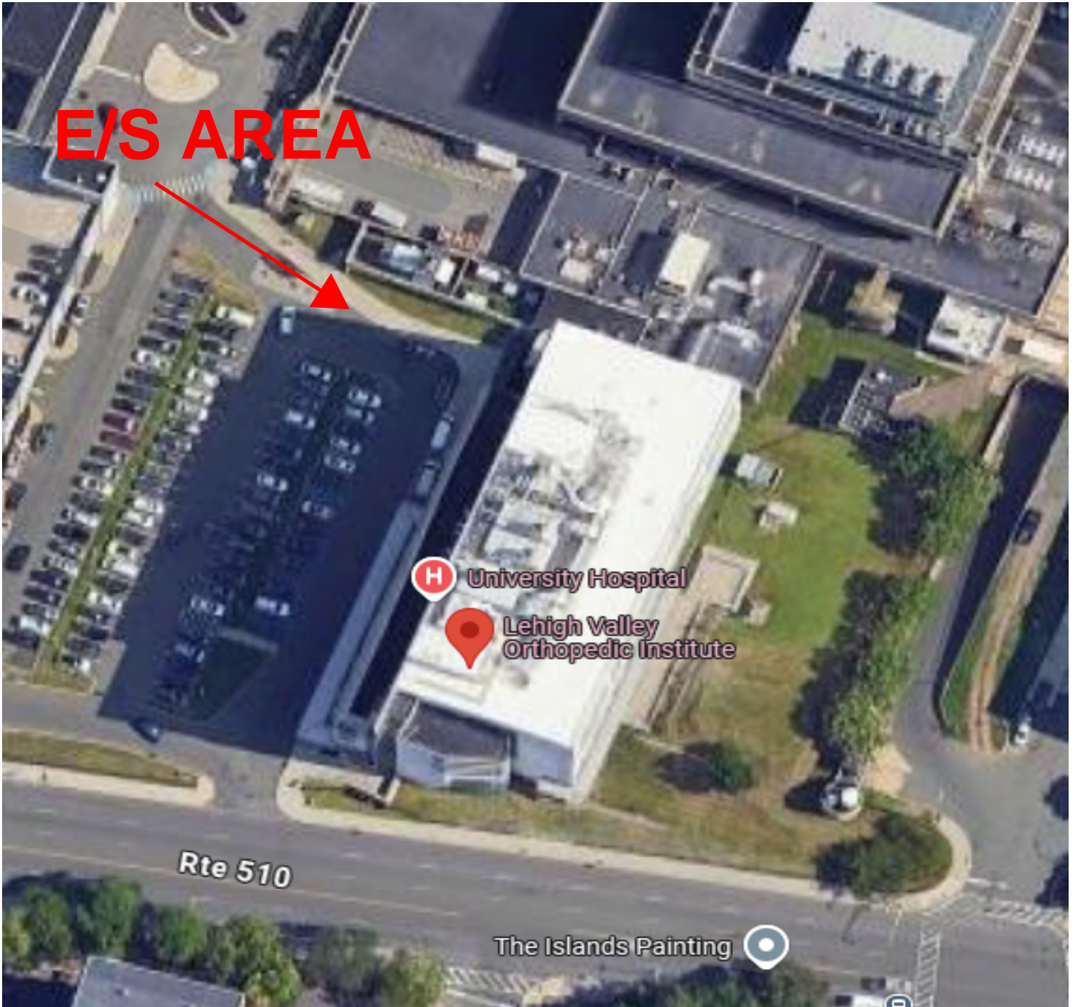
EMERGENCY STAGING AREA IS IN PARKING AREA AS SHOWN IN RED "E/S AREA"