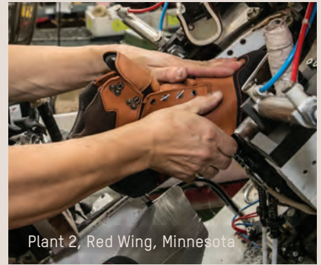
Plant 2, Red Wing, Minnesota

Expect our responsive local sales support to collaborate with our retailers to help your business benefit from decades of expertise in safety footwear.