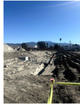
Photo 1: Great job benching/sloping B-type soil at 1:1. Photo 2: Please ensure there is a ladder at most 25 feet away from each employee. Photo 3: The trench is sloped properly at a 1:1